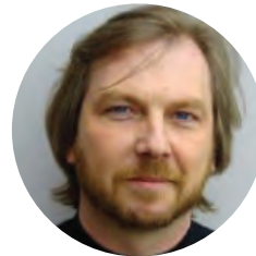
Lincoln Mead Canon Discovery Services